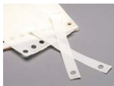
6-ea 94291 Clik-Clik™ Adhesive Strips