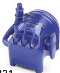
831 Mini Cool Aire® Dual Pro™ Inflator