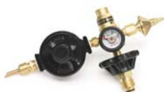
BR74HG Dual Foil + Latex Regulator