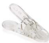
W50 Clip-N-Weight® Balloon Weight